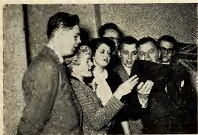
Elders and sisters of the Welsh and Bristol Districts met together for a Thanksgiving Day of feasting, song, game, and a testimonial meeting.